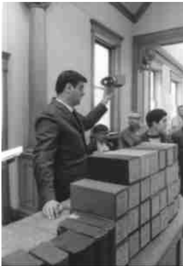
Auctioning the stereopticon, 1969

been underestimated. He argued that "Billings deserves something better than a remodeled warehouse for a library, and I do not think either the City Council or the Library Board will want to face the bar of history, and say that we gave the city less than the best."