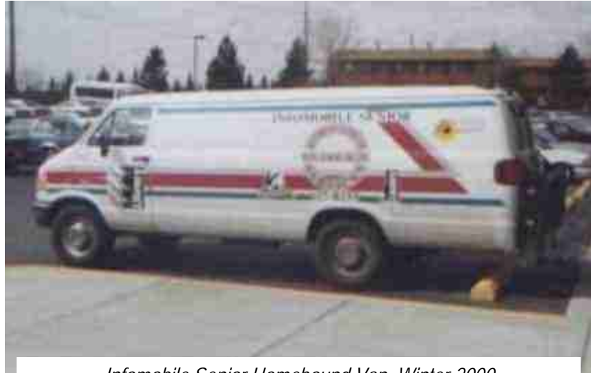
Infomobile Senior Homebound Van, Winter 2000

he preferred to be called) assumed his duties at Parmly Billings Library on October 1, 1990.