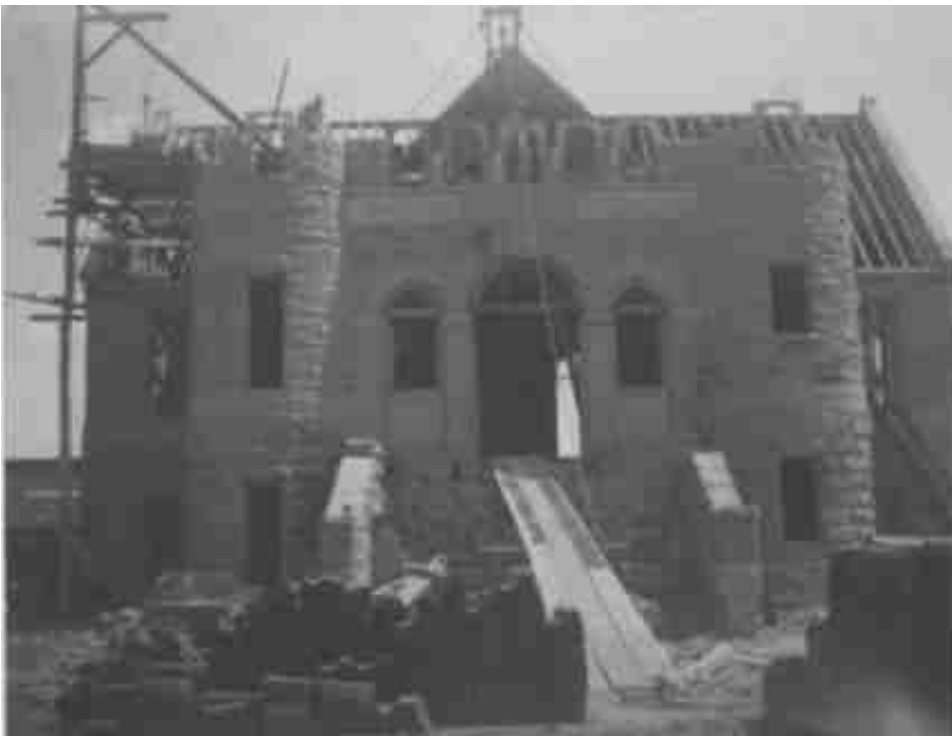
New Library under construction, mid-1901