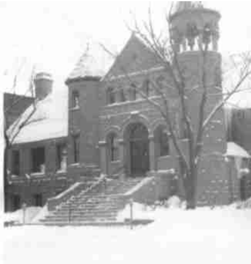
Parmly Billings Library in January, 1949

Billings had outgrown its library. What had been more than adequate for a town of 4,000 (the population of Billings in 1901) no longer met the needs of the 24,000 who dwelt