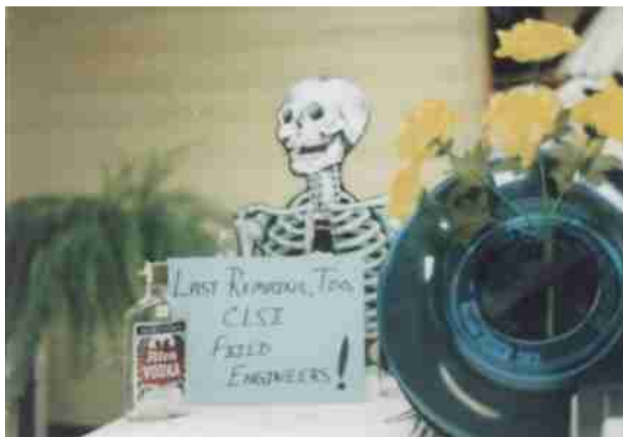
Old computer system “funeral,” 1988

Ellen Newberg responded to the library’s woes