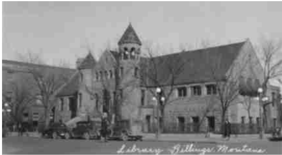
Library in the 1930s

the library’s collection contained books unsuitable for young people, but reassured her listeners that “every effort within the power of the local library staff is being made to prevent youthful borrowers from taking out books in this classification.”