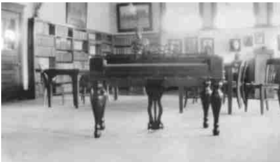
The library melodeon in 1934