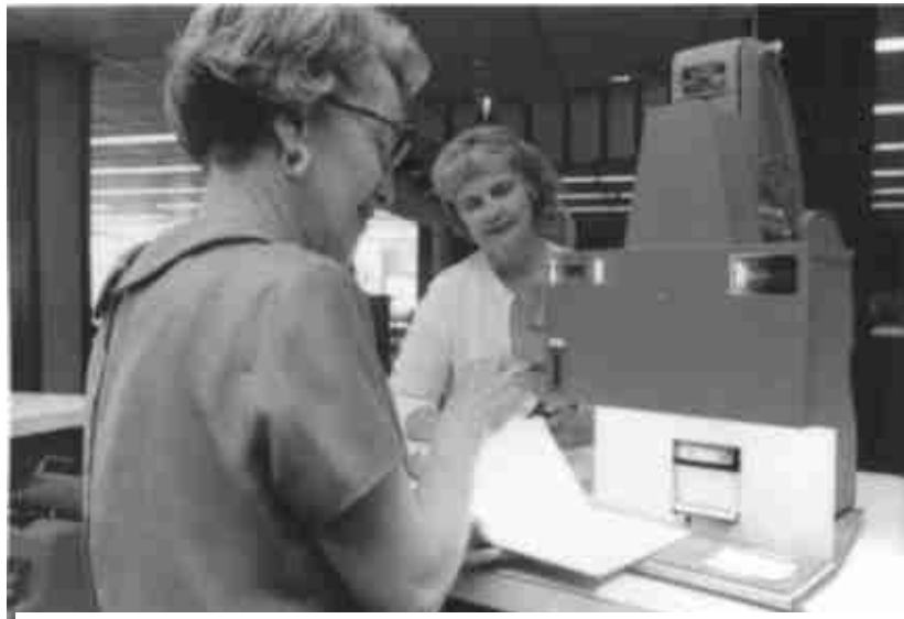
Checking out a book in the new building, 1969.

A cut in the book budget -- the usual remedy in such situations -- took care of the immediate problem. There was another problem, already ongoing for years, which proved much harder to solve. How could full library service be extended to all of Yellowstone County? Parmly Billings Library had been created to serve the