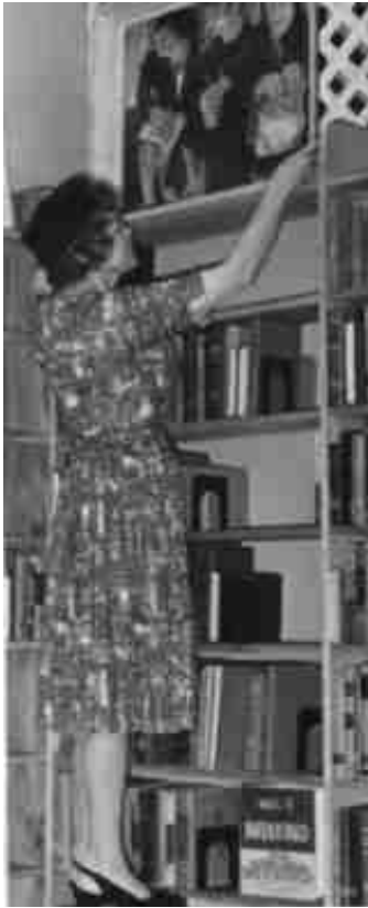
Setting up the Evergreen Branch Library, 1963

circulation and children's librarian, a secretary and a bookmobile assistant. The library could not offer competitive salaries even by the modest standards of the library profession, which were always lower than the average wages of the era.