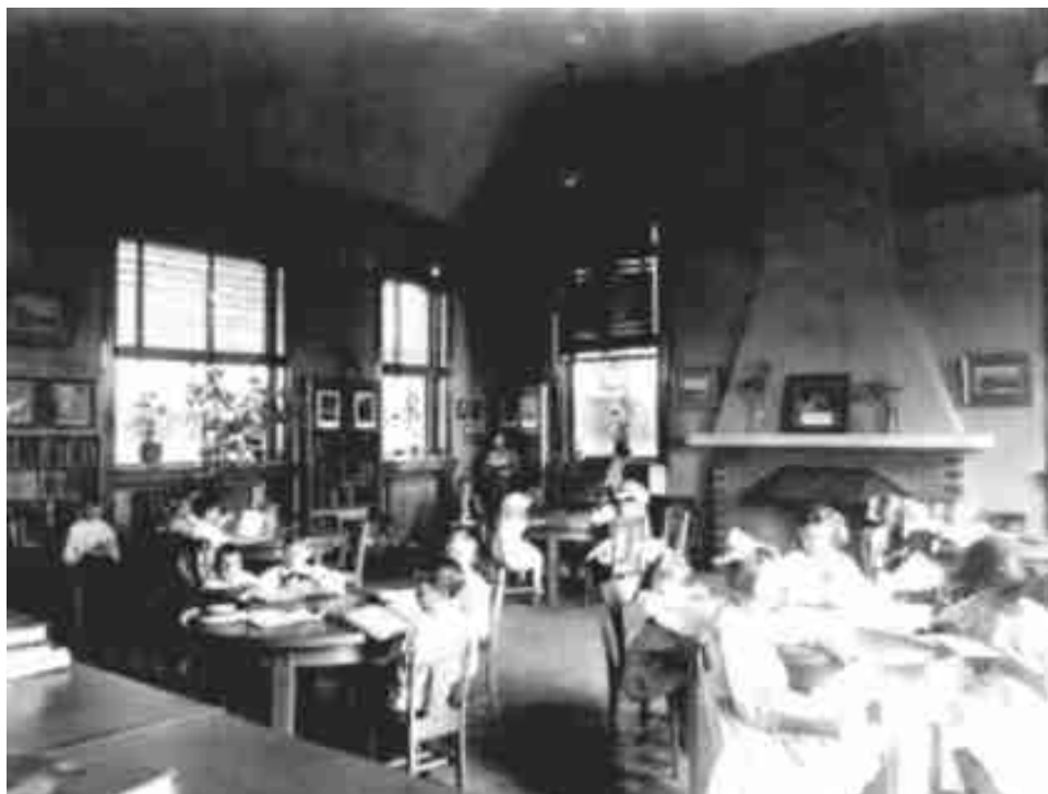
Children's Room, 1911