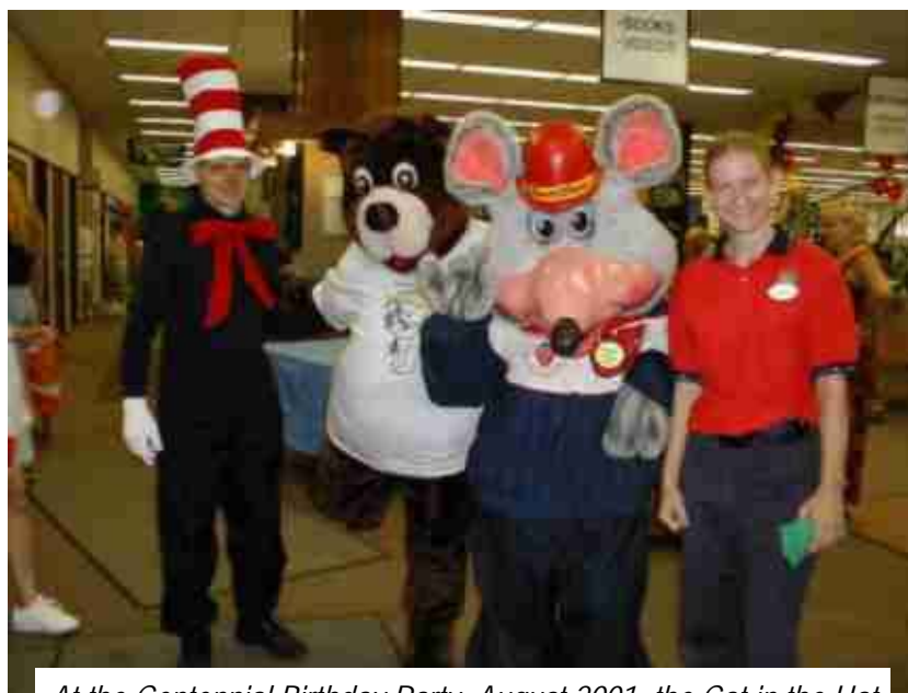
At the Centennial Birthday Party, August 2001, the Cat in the Hat meets Parmly Bear, Chucky Cheese, and a volunteer.

where the library building was located. Billings Heights, a population center in its own right, somewhat cut off from the downtown by transportation bottlenecks, also was an obvious location for a branch library.