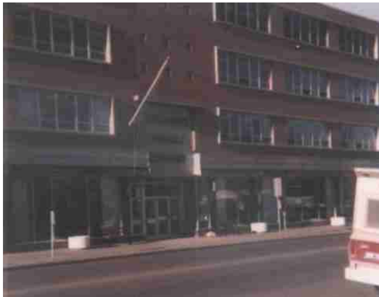
New Library building, 28th Street entrance, 1970s.

The ac- into the new not occur for years. First, Hardware needed time new quarters, to the build- transferred to August vacating date Hardware later--August