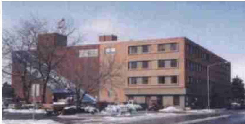
Parmly Billings Library in the mid-1990s.

ferred in its centennial year. With the support that it has always had from the people it serves, the library will continue to do so for another century, and likely much longer.