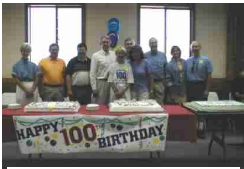
Centennial Birthday Party helpers:

The Montana Room contains a special collection of about 8623 volumes plus assorted microfilms, magazines, and newspaper clippings, including references pertaining to Montana as both state and territory, works by Montana authors, and works about events of interest to or occurring in Montana, such as the Battle of the