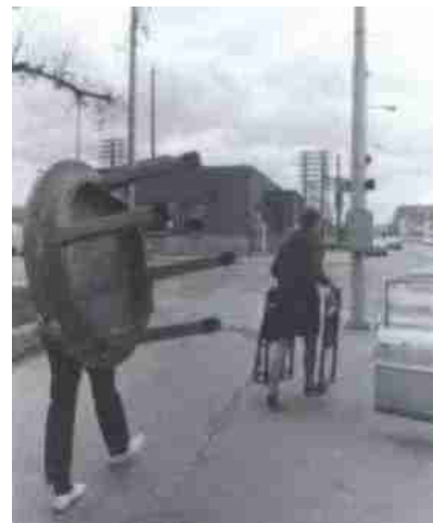
Successful bidders carry away their new possessions after the library auction, 1969.

In May of 1966, Mayor Fraser suggested that the new library should replace Cobb Field, the city baseball