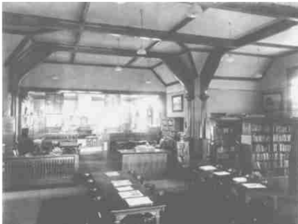
Main wing interior, 1911

For a deposit of one dollar, any citizen of Montana could borrow books from the library (twenty-five cents went to the library itself; the balance was used to pay postage for sending the books out and back). Teachers were allowed to borrow up to twenty books at a time for one month, and were charged a dollar for the school year. Already the library in Billings was serving a vast region and not just one city.