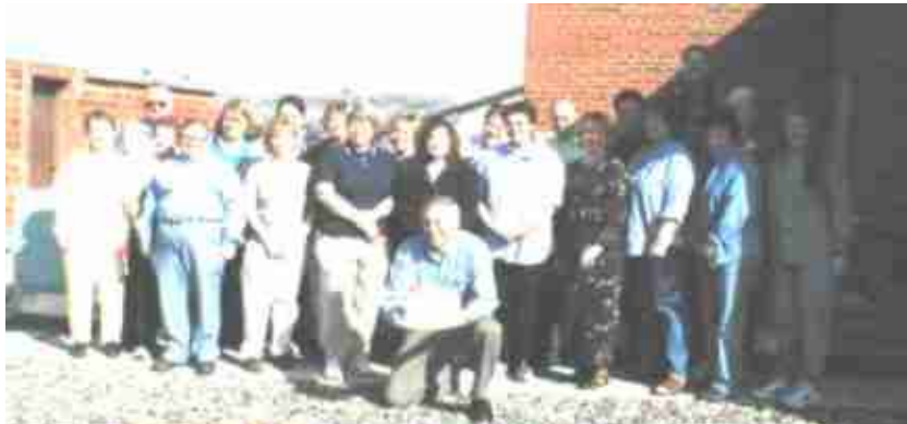
The Library staff on the roof, May 2002