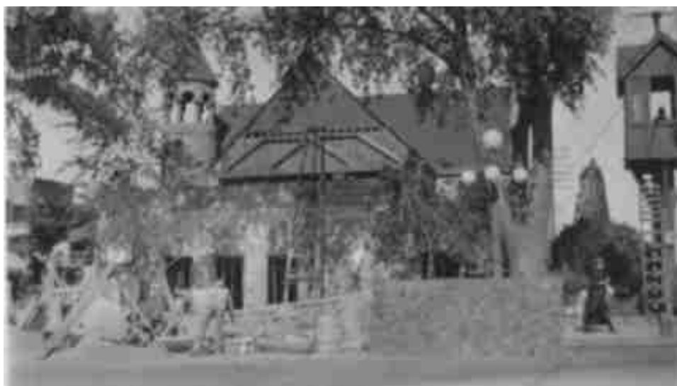
Adding a new wing in 1923

The library also found itself unwillingly involved in a dispute between the