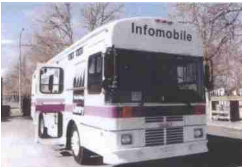
The new Infomobile on display at North Park, 1996

Bill Cochran knew that in an era even more hostile to increased taxes