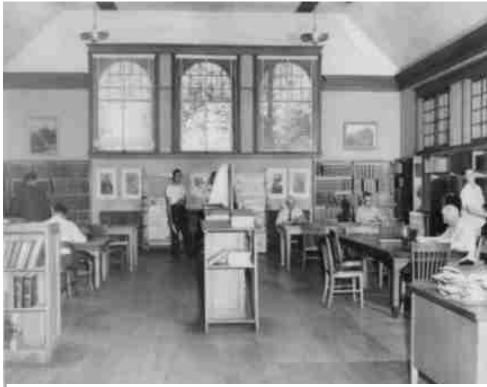
Inside the Library, 1952

The library had to cope with this situation for decades, and the staff carried out their duties despite the difficulties. This sometimes required hard decisions, as in August of 1949. In that month, the popular museum displays in the library basement were done away with.