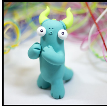
One of The Beastlies by Leslie Levings View more at beastlies.com

*Use other found objects as sculpting tools, to create textures, to use as a base to cover in clay, or to create a mixed media sculpture!